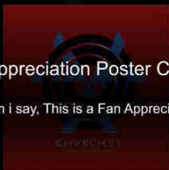
1st Album - The Bones of What You Believe

What can i say, This is a Fan Appreciation Poster for Scotland Synthesize pop Band CHVRCHES.