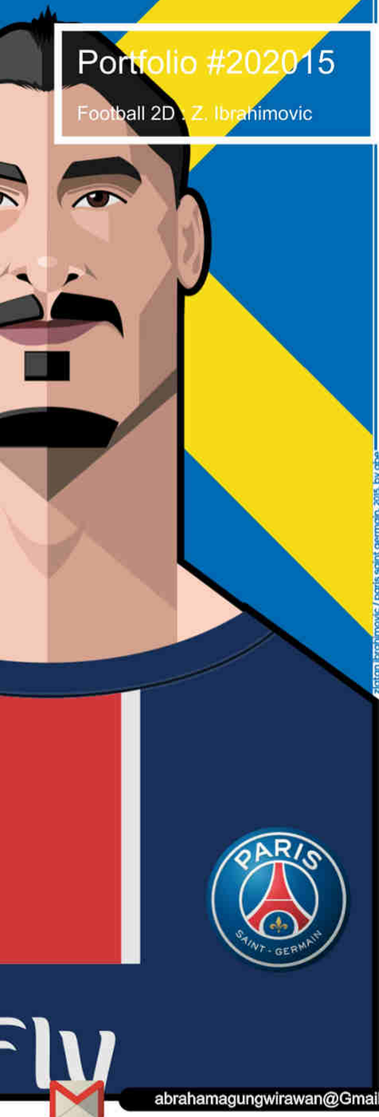
Zlatan Ibrahimovic / paris saint germain. 2015. by abe