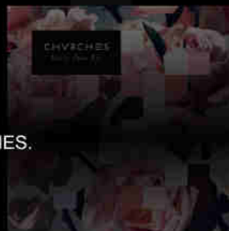
2nd Album - Every Open Eye

The Discography of Scottish electronic band Chvrches. studio albums, four extended plays (EPs) and one live album. The band was formed in Glasgow, Scotland, in 2011 and consist of Lauren Mayberry (lead vocals, additional synthesizers, sampler), Iain Cook (synthesizers, guitar, bass, vocals), and last but not least Martin Doherty (synthesizers, samplers, vocals).