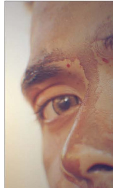
Photography Title: Eye Can Tell

Although covered by the rain, the beauty of Danau Batur still cannot be resisted by our eyes. The fog had come to adorn the panorama. The feeling when you see this picture of Danau Batur is like the tranquillity when you found an oasis on the desert.