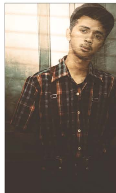
Photography Title: :Le Solitaire

Actually "Sayur Mayur" was create for another purpose which was for one of my group presentation's name. That time we should make a PSA about vegetables and we choose some topic; Kids & Vegetables Consumption. Because of that project in my spare time I've got an idea to make those vegetable more alive and finally I created cartoon character from vegetable.