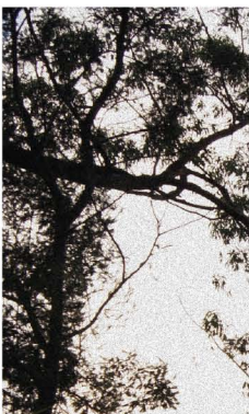
Photography Title: The Fall

This is my self project for photography. The themes is focusing on eyes. The idea everything that we actually feel, right or wrong, happy or sad, angry or timid, all can be shown through our eyes.