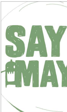
Title: Vegantoon

Also one of my favorite shoot. In this photo I want to share the hapiness, the leisure-ness that you could find in your good friend while enjoying summer. Summer is about sun, activity, being amused, and everything that's fun.