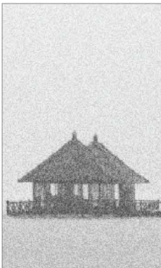
Photography Title: Oasis

This is my self project about a boy who is caught up in the big town by himself. He feel lonely and sad, he wanted to tell the other about his feeling how devastating he was, but he don't know how.