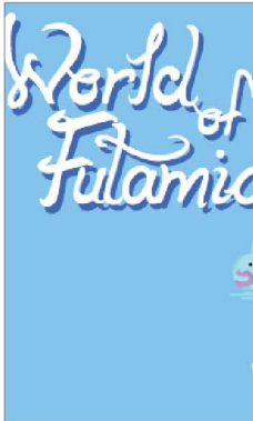
Illustration: Game's Map Title: World of Futamichi

The World of Futamichi was inspired by Tamagochi Land. This project is about to create new game's map with certain technique. I picked various character from Tamagochi that can supporting my Idea for the game's map. Tamagochi have many various cute character, I choosed this because it's very enjoyable to work with.