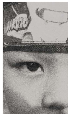
Photography: People Title: Little Hero

Wind blows, time goes. The trees grew as season changing. But sometimes the more they want to grow, to survive, the more the sacrifice is. With all reasons that universe have they trembling and obey to let go all the goods with sense of maturity and sincerity. They call this as The Fall.