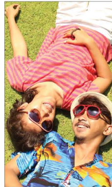
Photography Title: :Summer

The World of Futamichi was inspired by Tamagochi Land. This project is about to create new game's map with certain technique. I picked various character from Tamagochi that can supporting my Idea for the game's map. Tamagochi have many various cute character, I choosed this because it's very enjoyable to work with.