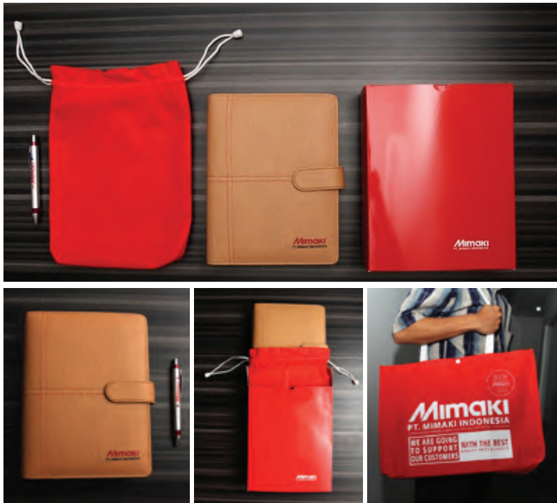
Stationery of Mimaki Indonesia Launching.