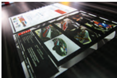
Pile of invitation card.