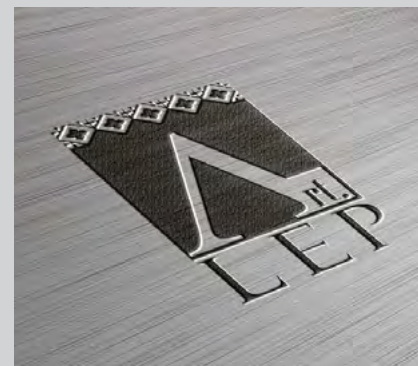
Beberapa desain logo yang telah saya kerjakan untuk beberapa klien.