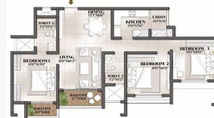
3 BHK Floor Plan