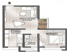
1 BHK Floor Plan