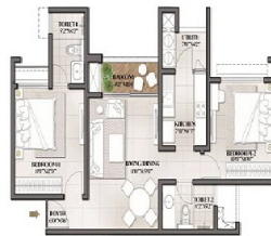
2 BHK Floor Plan